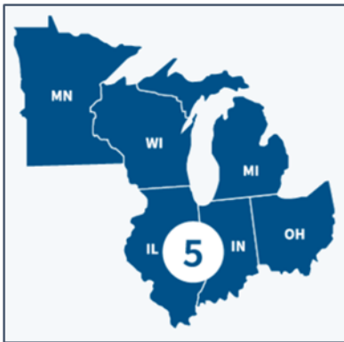
Corewell Health and the UMMC are a part of FEMA Region V.

Our RESPTC Programs work to enhance and support the National Special Pathogen System of Care (NSPS) to safely and effectively manage special pathogen response.